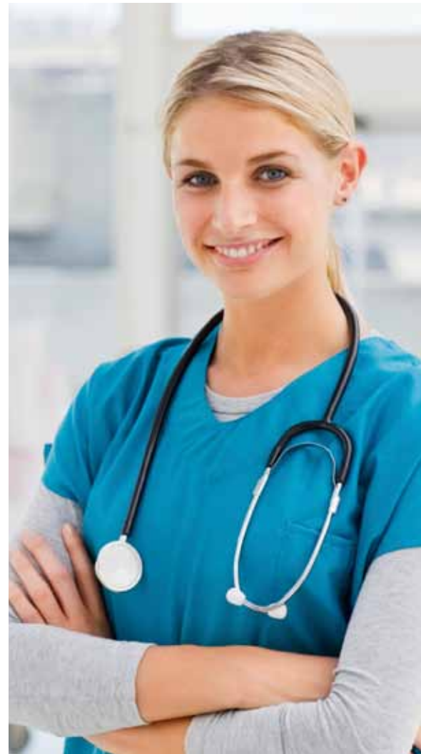
Table Talk with Exhibitors

As a conference sponsor, your company will benefit from extra exposure and more opportunities to promote your company as part of this prestigious industry event. Attendees will see your company name everywhere – from your company name listed on the entry signage, to your logo and description included in the Official Conference Directory, to your company logo on your sponsorship item!